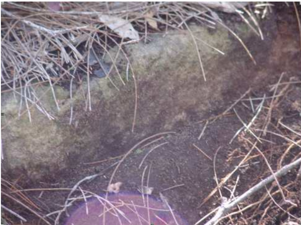
Close view of apparent cut road shoulder. Scutcheon marks appear visible in face of rock. Shoulder at bottom.