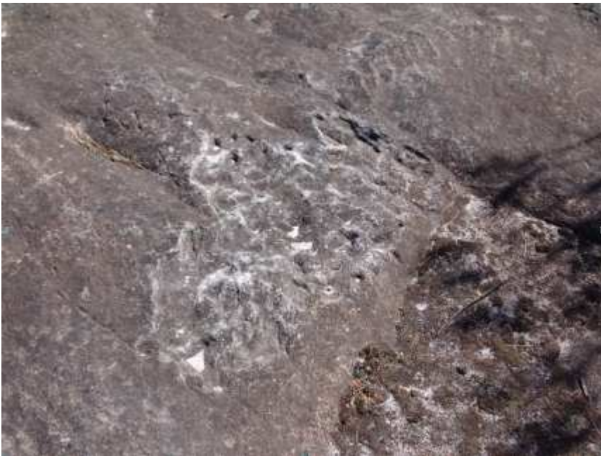
Detail of excavation rock work, north of pedestal rocks.