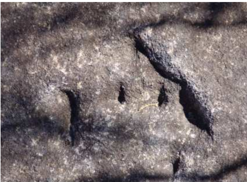
Marking of (so far) unknown significance, near excavation – North of pedestal rocks.