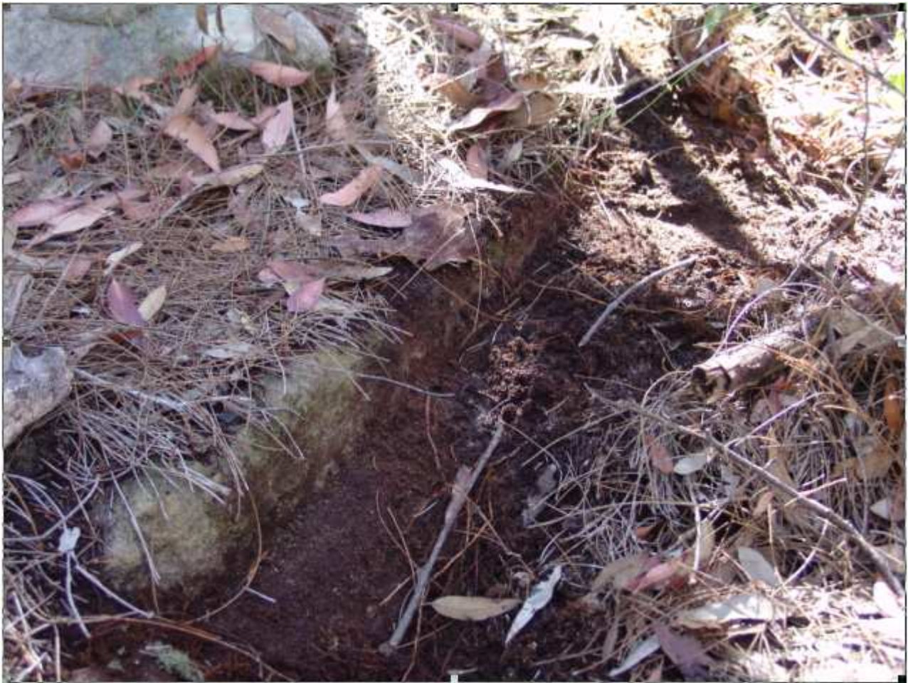
Apparent cut road shoulder, found under leaf litter, North end of Lot 26. This would be under proposed construction area.