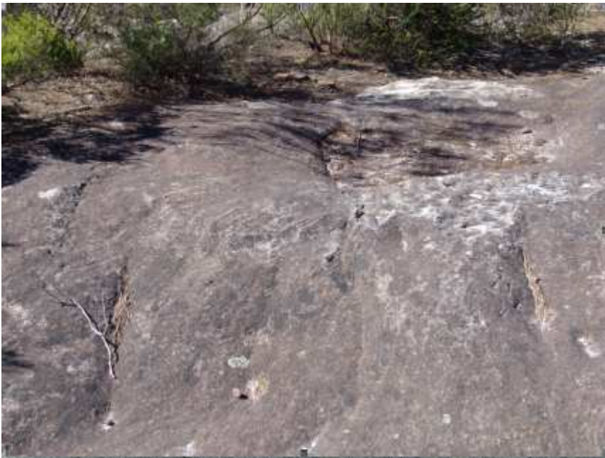
Apparent commencement of rock excavation work by Cox's work crew, south end of Lot 26. North of pedestal rock.